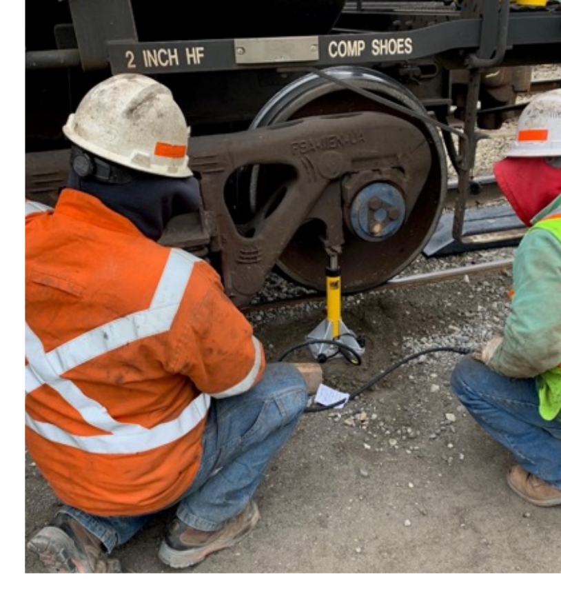
RWL25 Railcar Wheel Lift Kit in action.