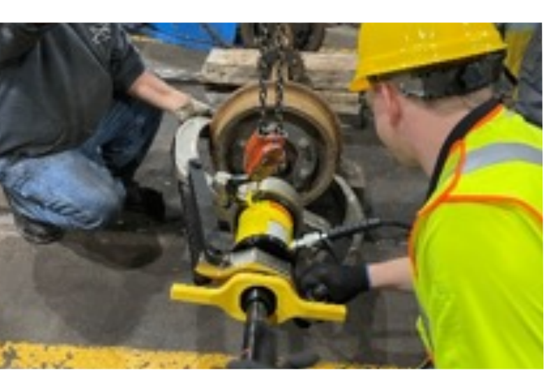
LGH-Series Puller eliminates striking and torching.